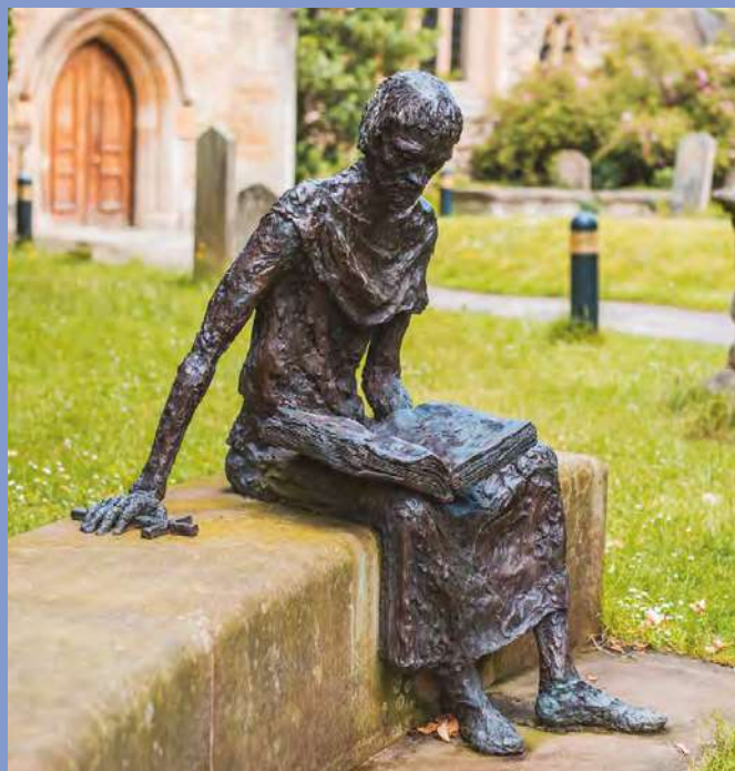
St Edmund statue in front of the College library - image by Marie Wong, entry in the Hall Photography Competition

The earliest surviving written record of St Edmund Hall dates back to 1317 although it may be much older.