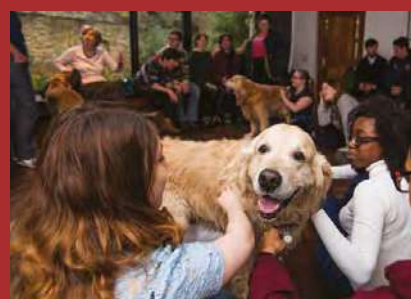
Students meet a tutor's dog, during a 'bring a pet to work day'