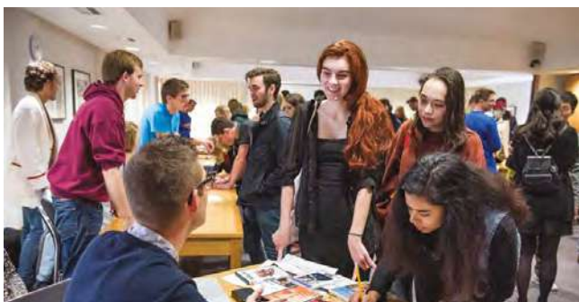
The College Freshers' Fair

"Creative writing is one of the Hall's strongest areas. The weekly writing workshop is extremely friendly and allows anybody to receive deeply nuanced and particular feedback on their work, as well as affording you the chance to be exposed to the work of a large number of extremely talented writers. It almost can't help but improve your writing, and is great fun in the process."