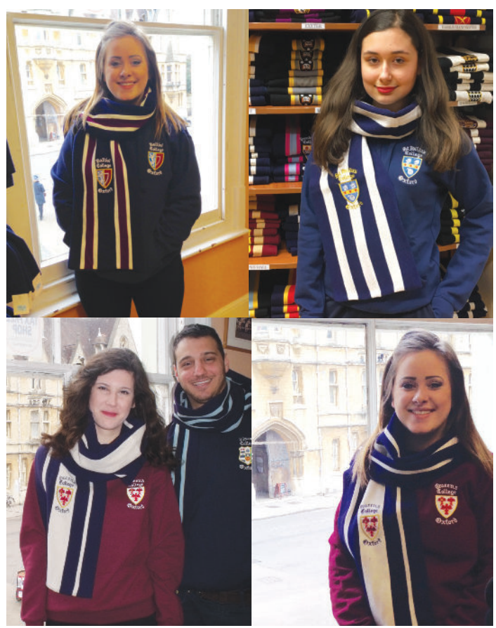
College Scarves + Hoodies