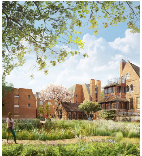
Architectural rendering of Norham St Edmund and its Ecology Pond

Via bequests given to the HALLmarks campaign's flagship project – the Norham St Edmund development – we will at last be able to accommodate all undergraduates, across all years. The provision of quality, reasonably priced accommodation is fundamental to attracting the brightest prospective students and providing a setting conducive to learning.