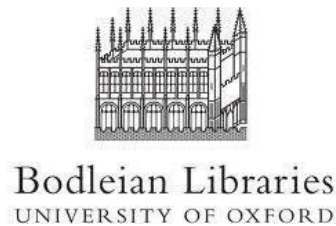
Figure 1: Bodleian logo

libraries that exist - most of which look utterly gorgeous, and all of which are worth investigating. In addition to being an invaluable source of books, they also provide a quiet environment in which to work.