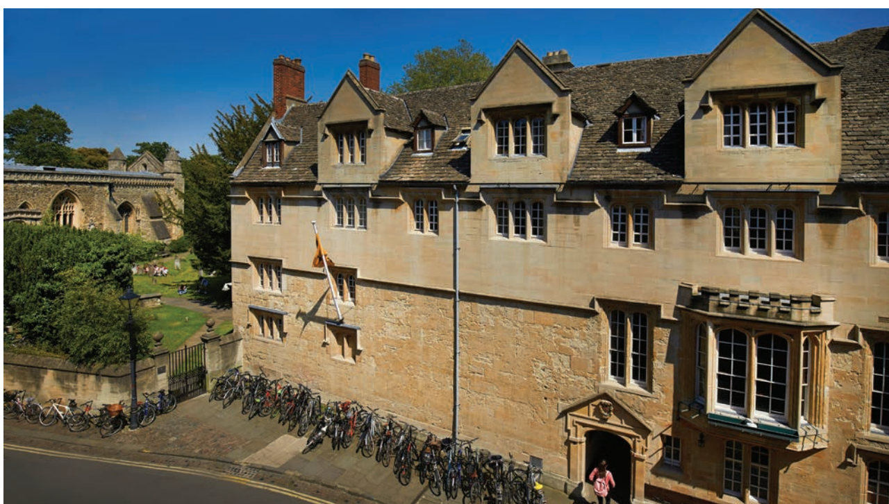
The main entrance to St Edmund Hall in Queen's Lane, conveniently located just off Oxford's High Street, close to many University buildings.

Teddy Hall has a friendly and relaxed atmosphere in which students are supported to excel in both their academic and extracurricular pursuits.