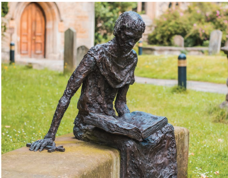
St Edmund statue in front of the College library - image by Marie Wong, entry in the Hall Photography Competition

The earliest surviving written record of St Edmund Hall dates back to 1317 although it may be much older.