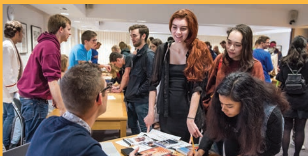
The College Freshers' Fair

"We're a very sporty College, but every team welcomes participation by people of any ability, and we also excel in other areas, for example our recent success on University Challenge."