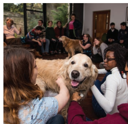
Students meet a tutor's dog, during a 'bring a pet to work day'